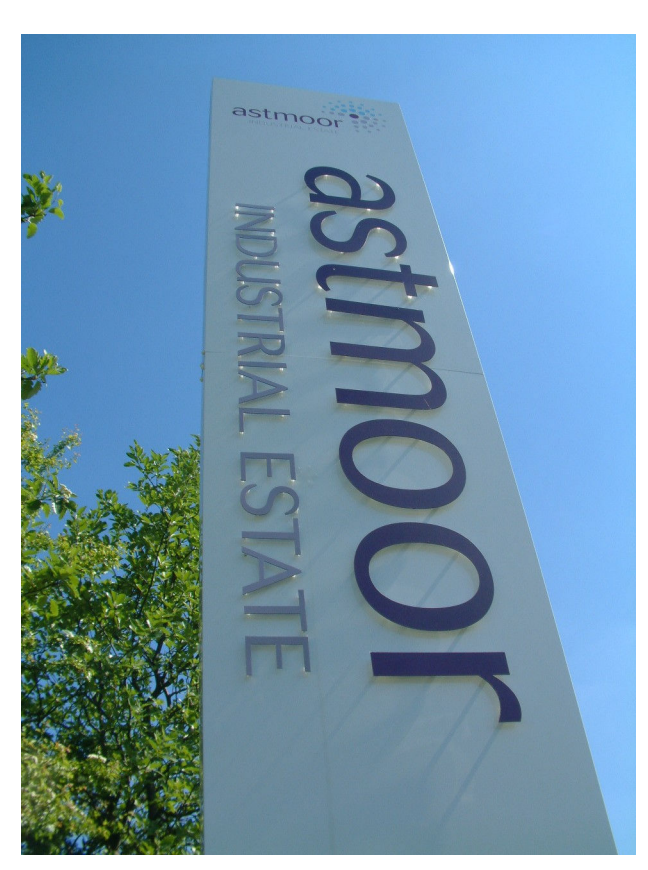
Appendix 3 – Recent press releases